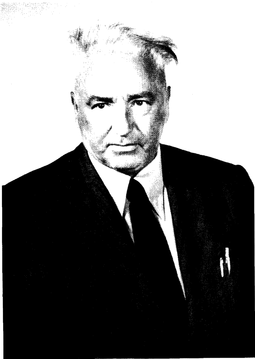
Wilhelm Reich (1952)